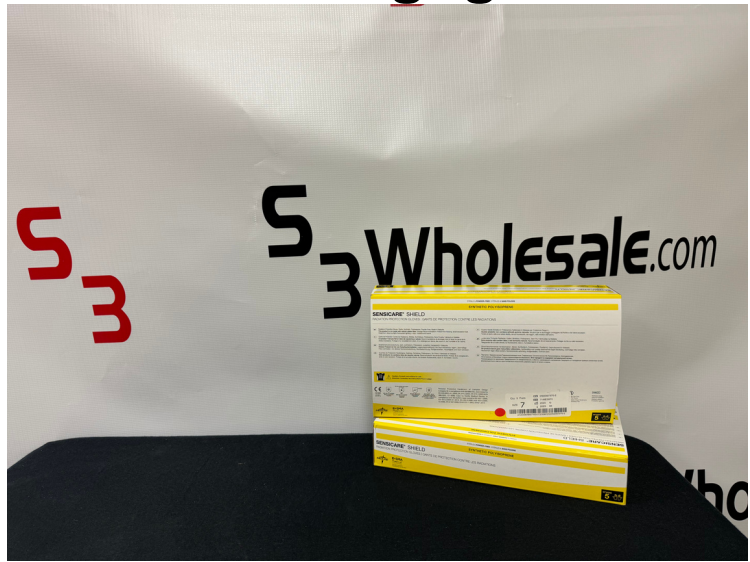
Size 7 5 pair per box. 4 boxes per case $750 per case