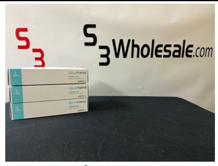
Large. 100 per box. 10 boxes per case 1000 per case $40 per case