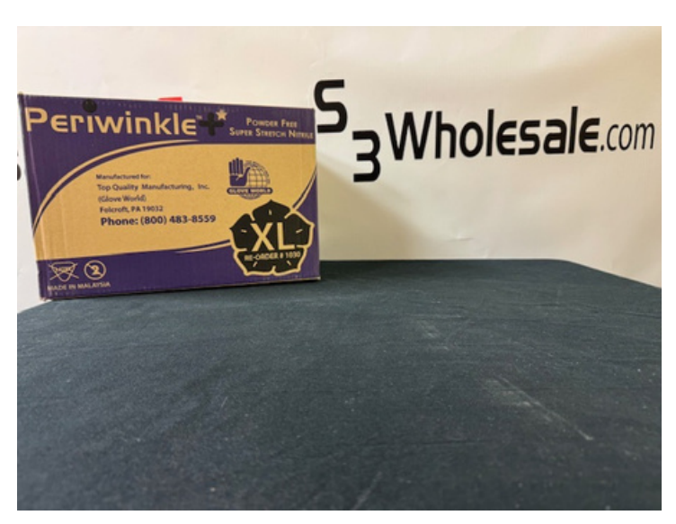
Extra Large 100 per box. 10 boxes per case 1000 per case $40 per case