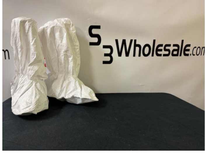
100 pair per case.