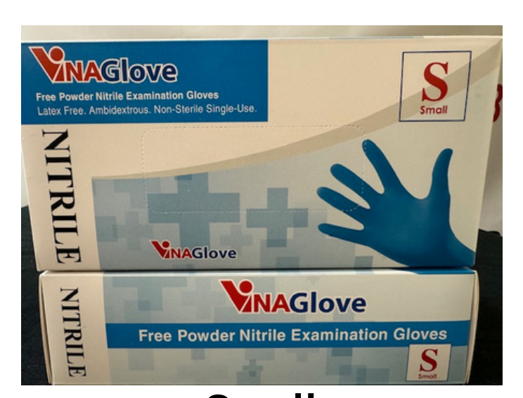
Small 100 per box. 10 boxes per case 1000 per case $40 per case