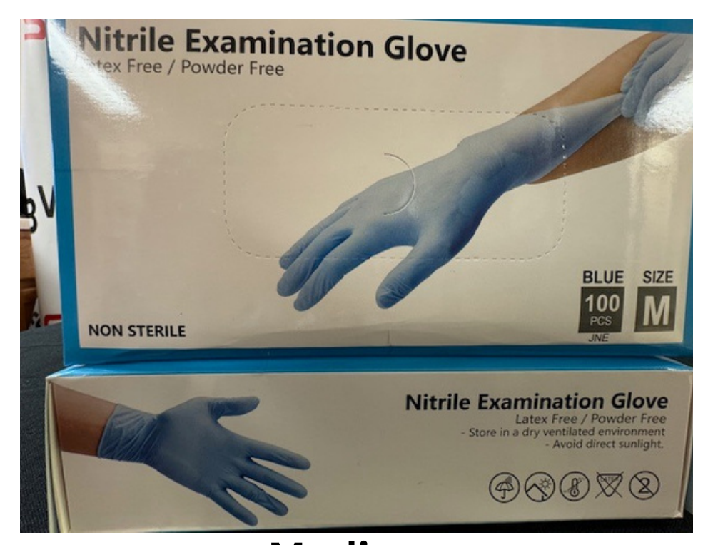
Medium 100 per box. 10 boxes per case 1000 per case $40 per case