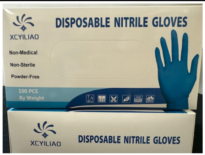
Medium 100 per box. 10 boxes per case 1000 per case. $40 per case