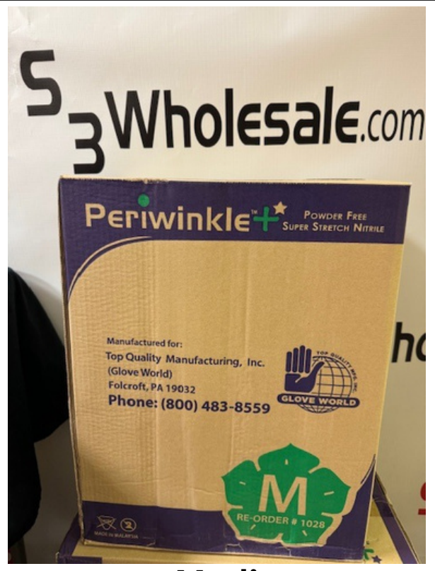
Medium 100 per box. 20 boxes per case. 2000 per case $70 per case