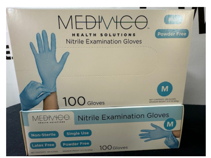
Medium 100 per box. 10 boxes per case 1000 per case $40 per case