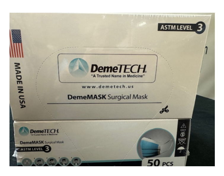
50 per box 1 box $20 $15